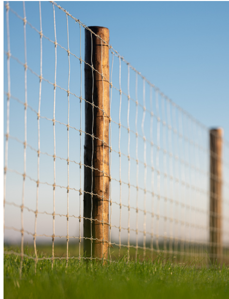
FENCES FOR OTHER LIVESTOCK