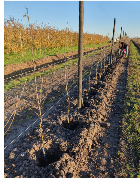
FRUIT TREE SUPPORT SYSTEM